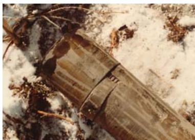
Typical pipe problems experienced

A sonic drill with a Hawker Siddeley head operated by Polar Drilling was also used, at about the same time, in California, to drill a placer type deposit.