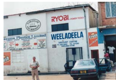
Zambian Entrepreneur – Kitwe, Zambia circa 2001