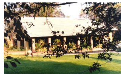
Sherbourne Guest House – Kitwe, Zambia