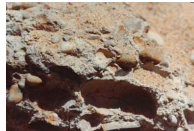
Rocks being drilled

A sonic drill with a Hawker Siddeley head operated by Polar Drilling was also used, at about the same time, in California, to drill a placer type deposit.