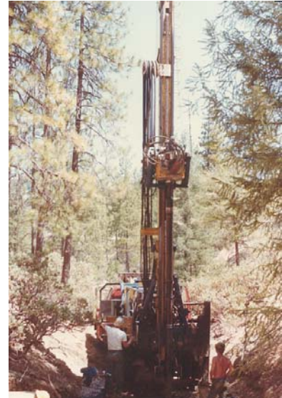
Sonic rig in California